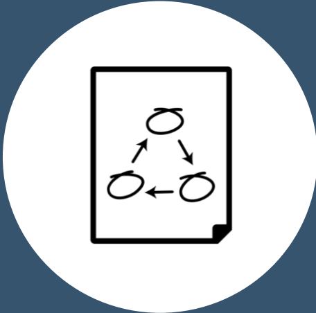
MAKE A PLAN